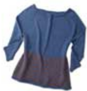
A sweater? Or even a crown: