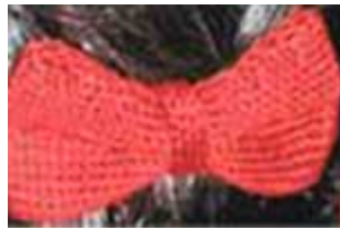
Knit a Hair Bow:

Did you enjoy this pattern? If so, please consider downloading another!